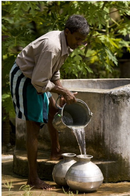
A man retrieves water from a community well. His home is being rebuilt with help from Rotary and Habitat for Humanity. Ambalangoda, Sri Lanka.

Thanks to those of you Rotarians and Interactors that attended our District Assembly in Laramie on October 29 th . There was