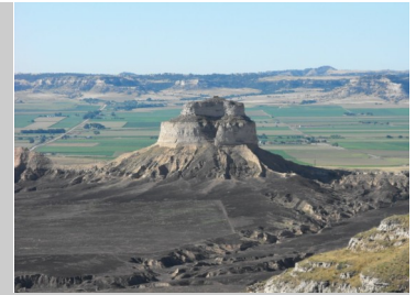
Scotts Bluff National Monument