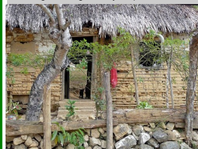
Typical construction of Arenal house