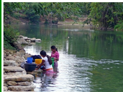
Arenal girls doing laundry-Mopan River