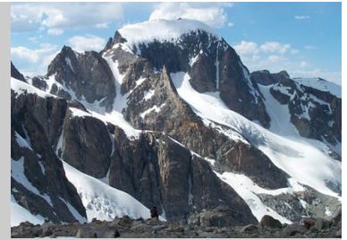
Gannett Peak, WY