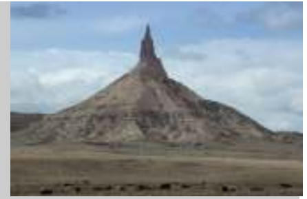
Chimney Rock National Historic Site, NE

Rotary International District 5440, Inc.