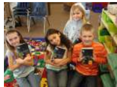
Third graders in Moran, WY, proudly display their new dictionaries, presented by the Jackson Hole Rotary Supper Club

most impressively, the club worked closely for two years with local Interact students to help them achieve their dream of trekking to the mountain village of Thame, Nepal to establish that community's first children's library.